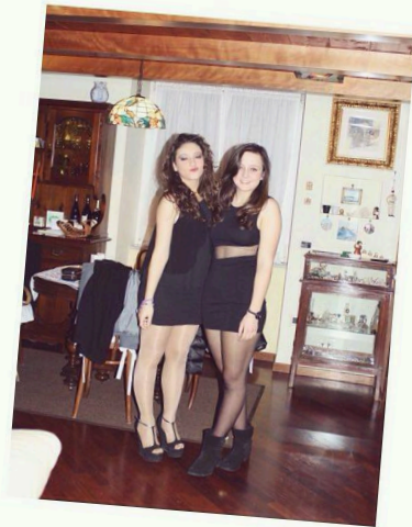
Me and my best friend