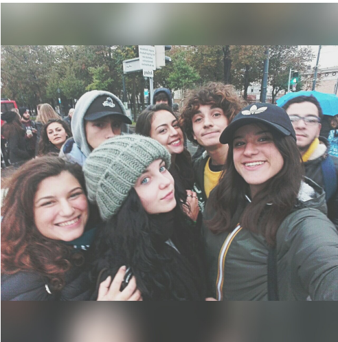
me with my friends

My hobbies are going to the gym, I have been practicing artistic gymnastic since I was 10. I really love listening to music and going out with friends.