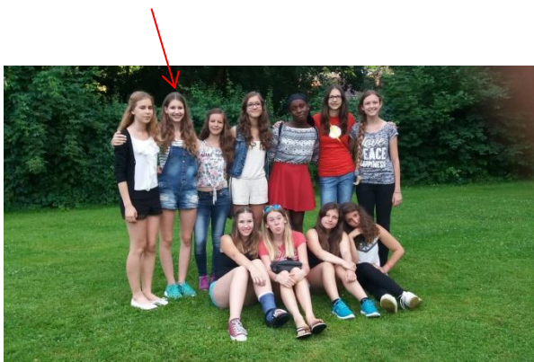
Me and my friends

I'm really looking forward to meet other people of the „Erasmus- project“ and to visit the other country.